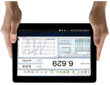
LoadVUE Pro Software

Cover the Sensor with a disposable Plastic Cover (sleeve) to protect it from getting wet and to maintain hygiene.